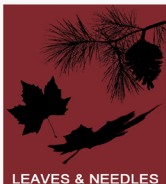
LEAVES & NEEDLES