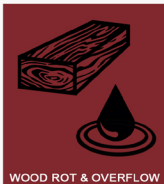
WOOD ROT & OVERFLOW