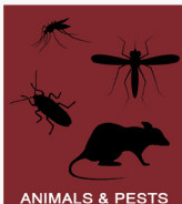
ANIMALS & PESTS